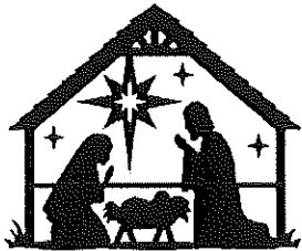
Oh Holy Night